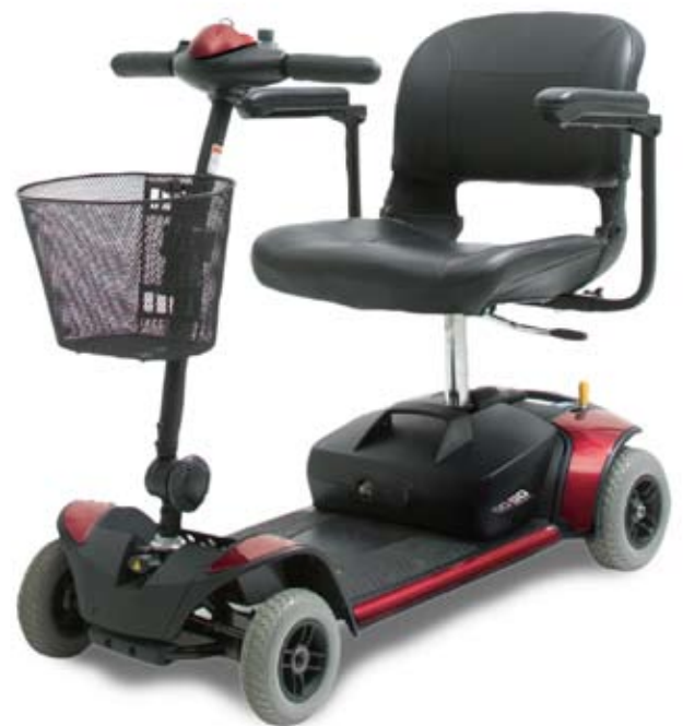
Go-Go Elite Traveller®, 4-wheel