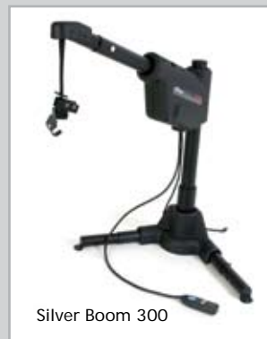
Silver Boom 300