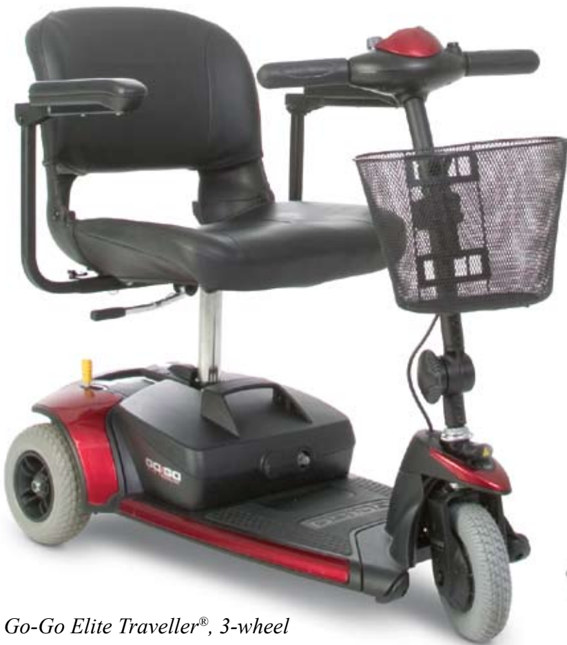
Go-Go Elite Traveller®, 3-wheel

The Go-Go Elite Traveller® 's compact design allows it to easily maneuver in tight spaces while providing stable outdoor performance. Take the guesswork out of travel with simple, one hand Feather-touch disassembly. Go where you want to go, easily, with the Go-Go Elite Traveller.