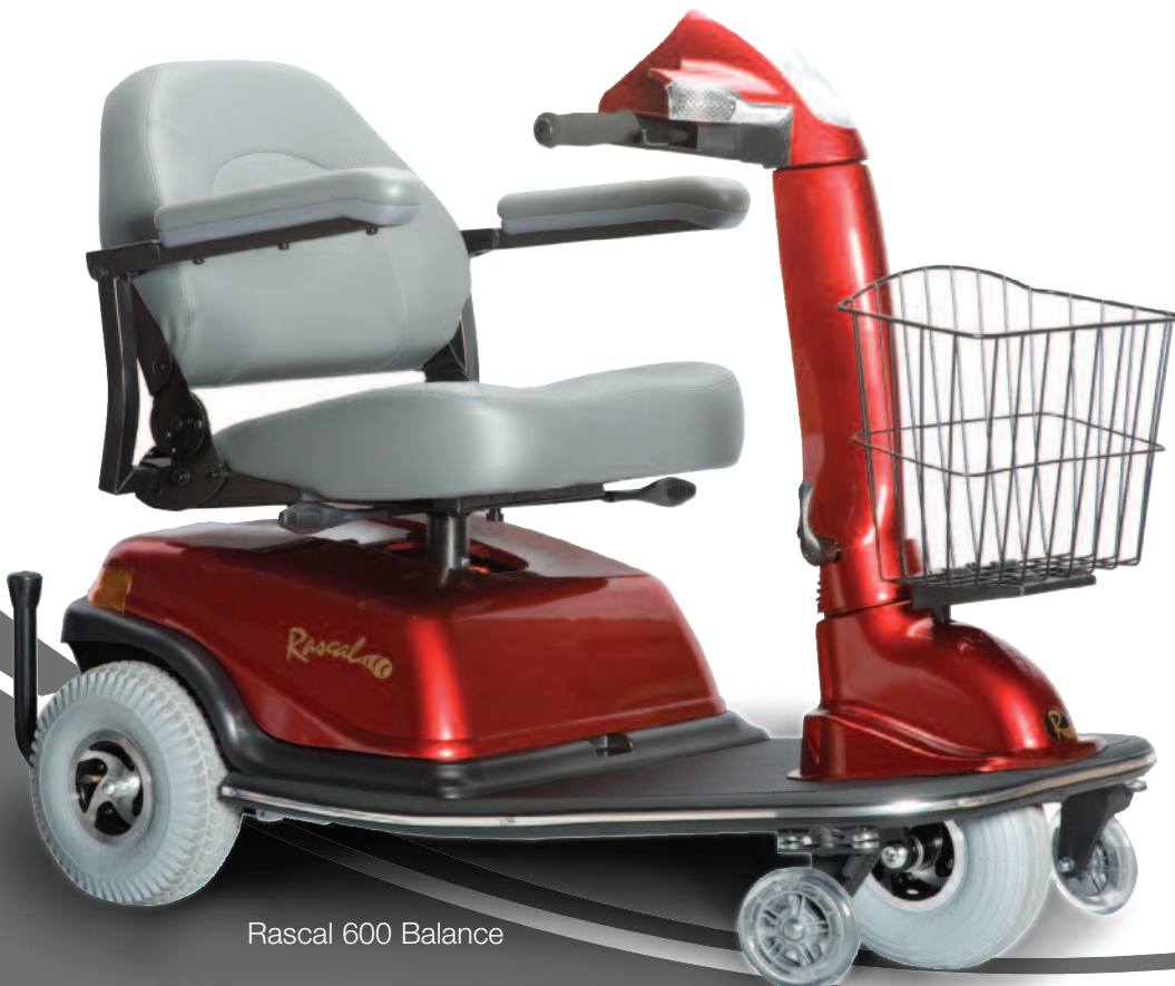
Rascal 600 Balance

Frame-Forward™ design, increases leg and foot room. Stretch your legs to improve posture and weight distribution. Increase comfort by adjusting seat and handlebar.