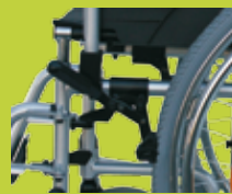
Depth adjustable steel brakes.