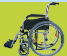
Easily transportable steel wheelchair with a range of high quality features.