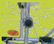
Quick release rear wheel setting.