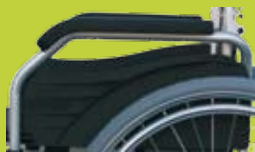
Long flip backwards armrests.

Mobility solutions for independent living