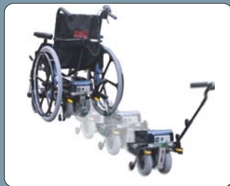
Easy to use! Mountable in just a few moments.