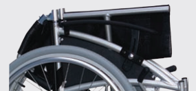
Half folding backrest making chair very compact