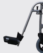
Quick release removable and swing away footrests.