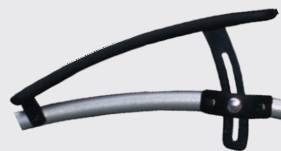
Height adjustable armrest 6-18cm.

Standard with maintenance free PU front (7") and rear wheels (24").