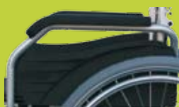
Long flip backwards armrests.

Mobility solutions for independent living