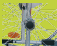
Quick release rear wheel setting.