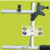
Multi-adjustable rear axle plate

Mobility solutions for independent living