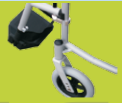
Height adjustable footplates.