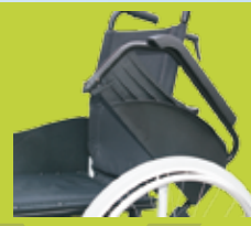
Flip backwards and removable armrests.