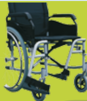
Swing away and removable footrests.