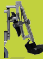
Supremely comfortable length compensating elevating legrest option. Includes easy adjustable calf support.