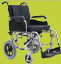
Also available in Transit version, fitted with 12" rear wheels. Seat height standard is 52 cm.

Mobility solutions for independent living