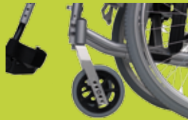
With: - Seat height adjustable. - Flat free (PU) front and rear wheels.