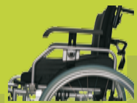
Flip backward, height adjustable and detachable armrests, (optional detachable clothes protectors)