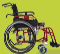
Available in various frame colours. Frame colour option: scuderia red.