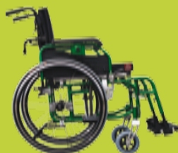
Available in various frame colours. Frame colour option: lime green

Mobility solutions for independent living