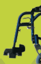
Swing away and depth adjustable footplates.