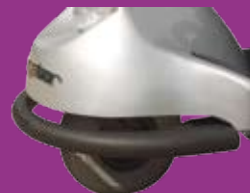
Equipped with front bumper for safety and to protect the plastic covers.