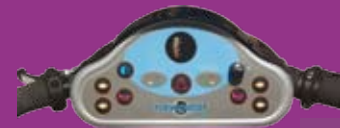
Easy to use waterproof dashboard, with touch operation.