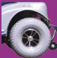
Equipped with an anti tip system.

Mobility solutions for independent living