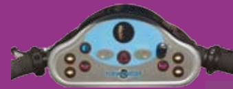
Easy to use waterproof dashboard, with touch operation.