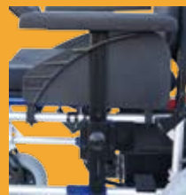
Height adjustable armrests. Adjustable to the wishes of the user.