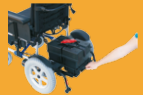
Battery packs are easy to disassemble and assemble.