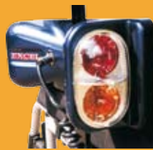
Optional lighting, see and be seen.