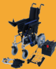
Foldable wheelchair, easy to transport.

Mobility solutions for independent living