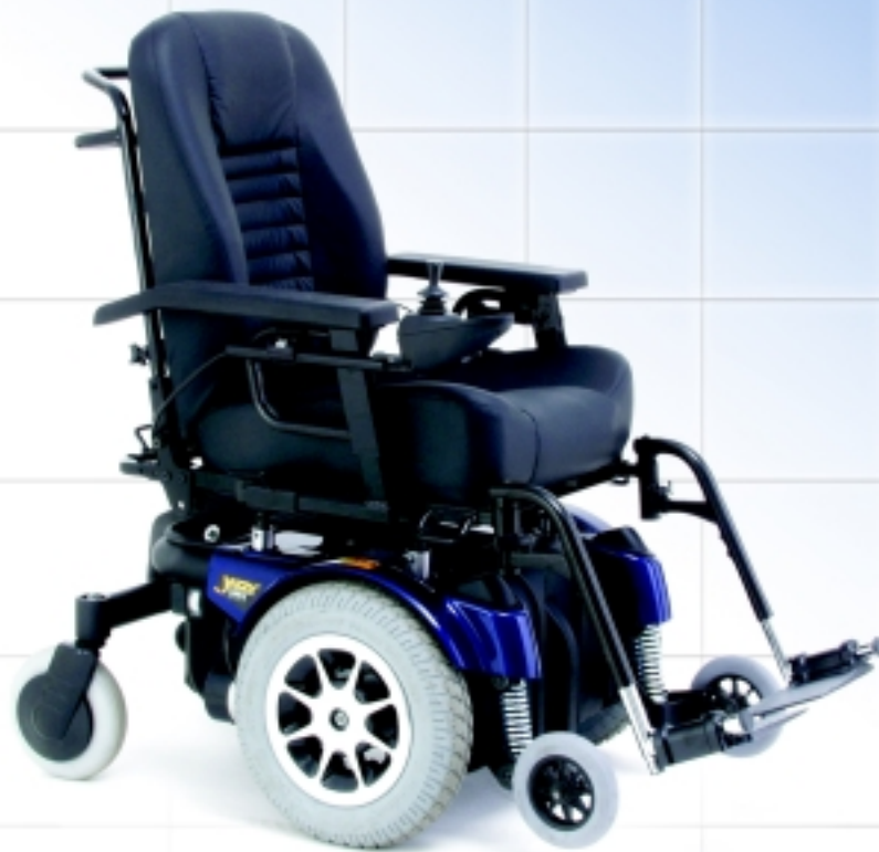
JAZZY 1121 Shown in Viper Blue with the Modular Seat, footboard and optional Pilot Plus controller

The Jazzy ® 1121 with enhanced Active-Trac Suspension (ATS) makes easy work of rough and uneven outdoor terrain. Plus, an articulating rear castor beam and patented resilient, adjustable front anti-tips further serve to add to the 1121's comfort and stability. Even tight-space indoor manoeuvrability is made easy with the 1121's compact overall size and mid-wheel drive design. The Jazzy 1121 with ATS is the perfect power chair for your diverse and demanding lifestyle.