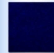
Viper Blue (std)