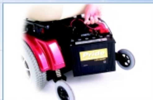
■ Easy access to front batteries