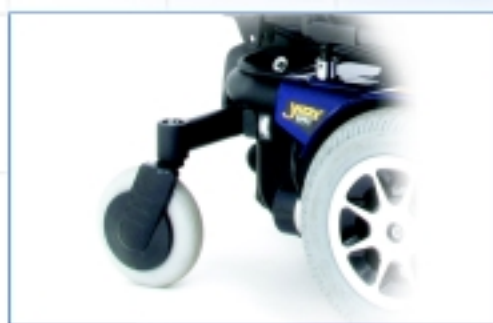
■ Rear articulating castor beam