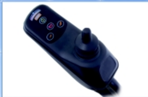
■ New VSI integral controller