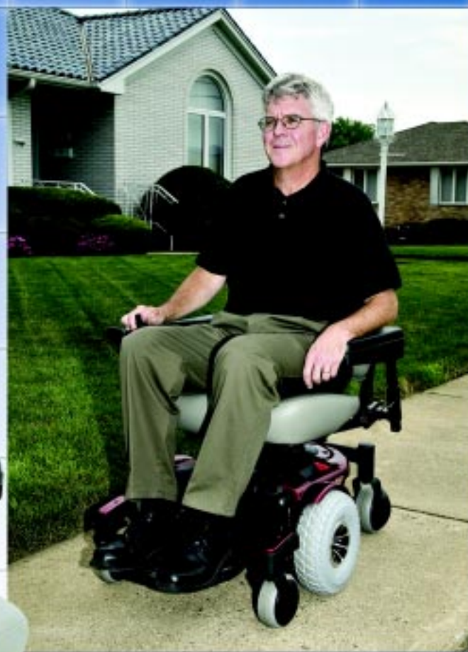
Jazzy ® 610 Shown in Blue with economy seat, footboard and VSI controller