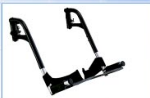
■ Swing-away footrests