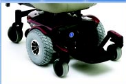
■ OMNI-Castors on front and rear