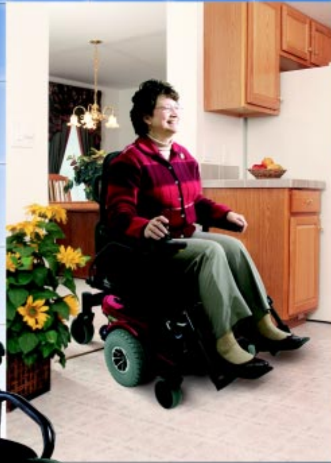
Quantum ® 610 Shown in Red with Synergy ® seat, swing-away legrests and VSI controller

Equipped with our patent pending Mid-Wheel 6 ® , the Quantum ® 610 delivers maximum stability without compromising performance. The independent active OMNI-Castors (nylon, spherical-shaped castors) raise and lower to compensate instantly for changes in the terrain and allow for smooth and stable transitions. The Quantum 610 is the ultimate choice for users who demand maximum stability, tight manoeuvrability and all-around performance.