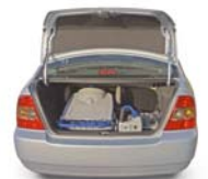
The Classic stored in the trunk of a car